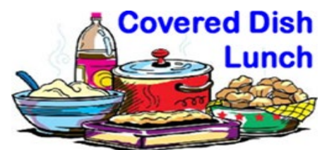
Following the Morning Service

I have one brother who is 17 months younger than me, and we are extremely close. I am looking forward to being the pastor at Frankston Methodist Church.